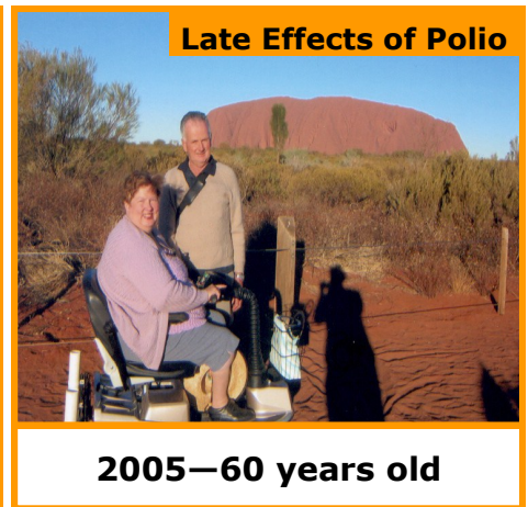
Late Effects of Polio